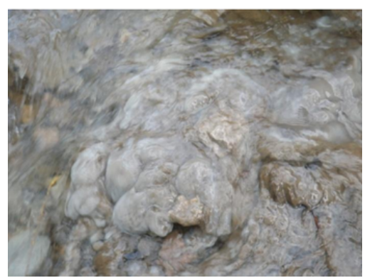
LEPTOMITUS LACTEUS FILAMENTOUS FUNGUS OVERLAPPING COTTON WOOL-LIKE STREAMERS