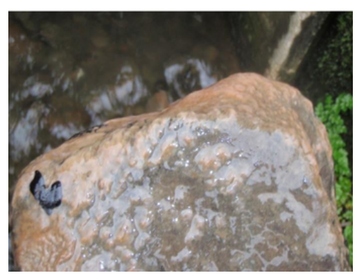
FUSARIUM AQUAEDUCTUUM FILAMENTOUS FUNGUS IMPARTS PINK OR RED COLOURATION