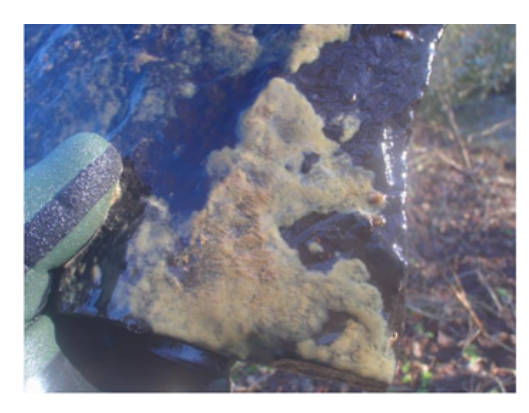
CARCHESIUM POLYPINUM STALKED PROTOZOAN SHORT 2-3MM TUFTS