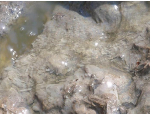
ZOOGLOEAL BACTERIUM ILL DEFINED TAXONOMICALLY JELLY-LIKE GELATINOUS MASS