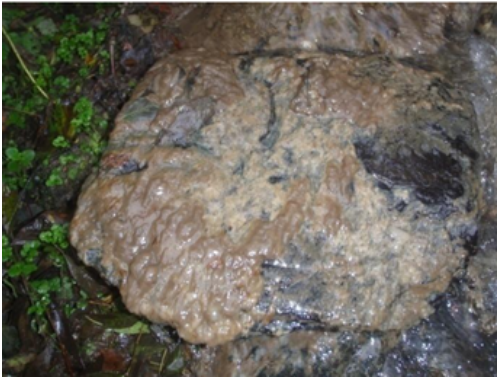
GEOTRICHUM CANDIDUM FILAMENTOUS FUNGUS SOFT TEXTURE LOOSELY FOLLOWING CONTOURS OF STONES